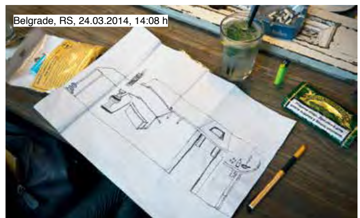
Belgrade, RS, 24.03.2014, 14:08 h