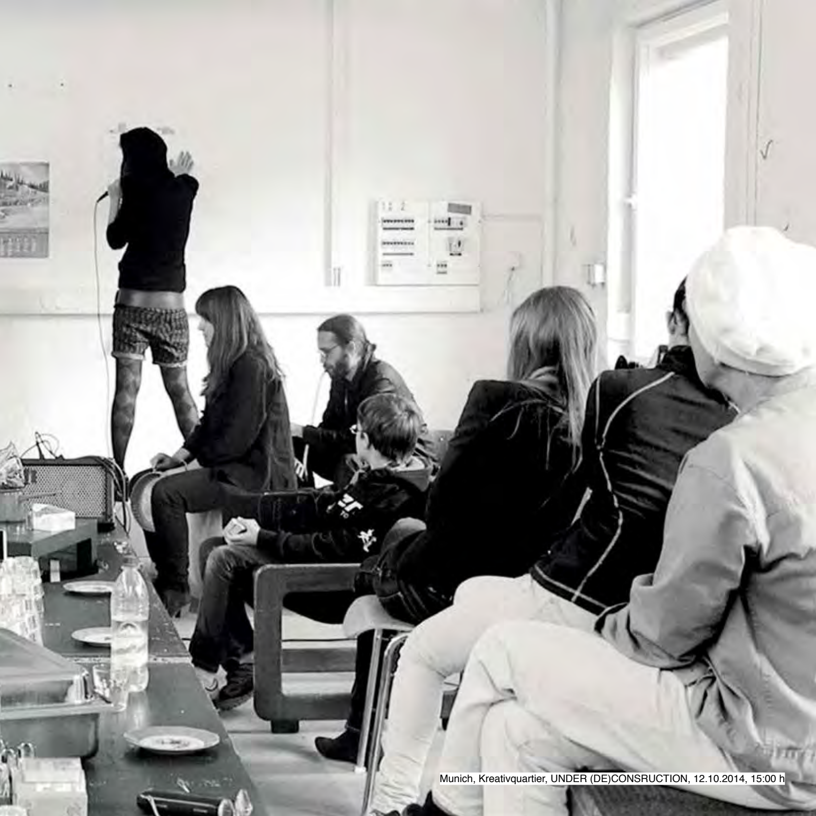
Munich, Kreativquartier, UNDER (DE)CONSTRUCTION, 12.10.2014, 15:00 h