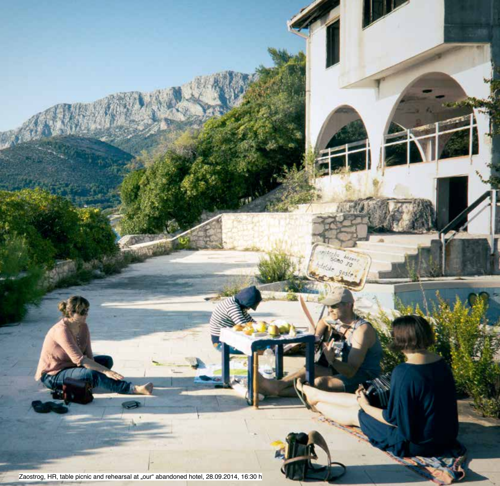
Zaostrog, HR, table picnic and rehearsal at „our“ abandoned hotel, 28.09.2014, 16:30 h