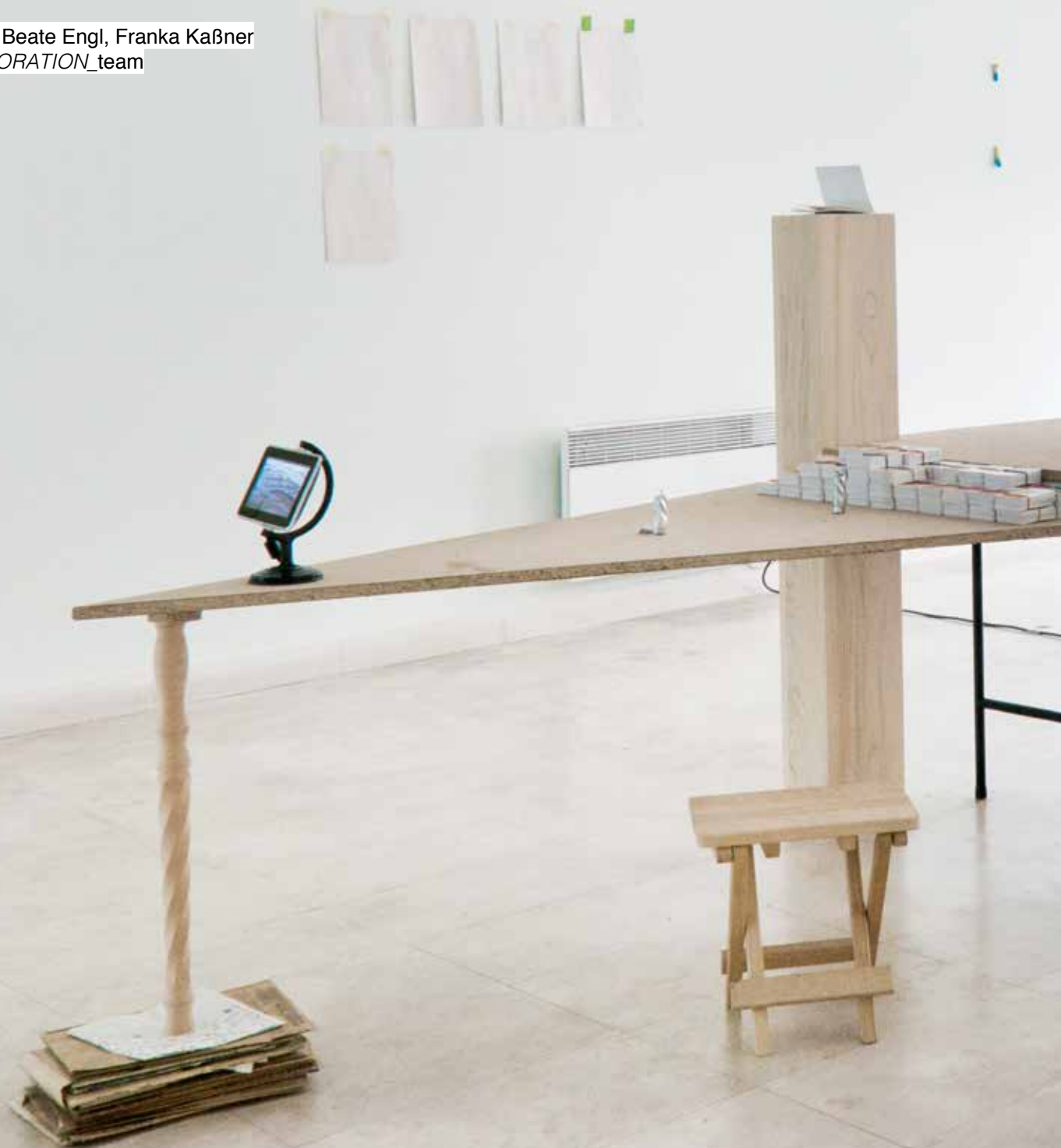
Table display: Beate Engl, Franka Kaßner with COLLABORATION_team