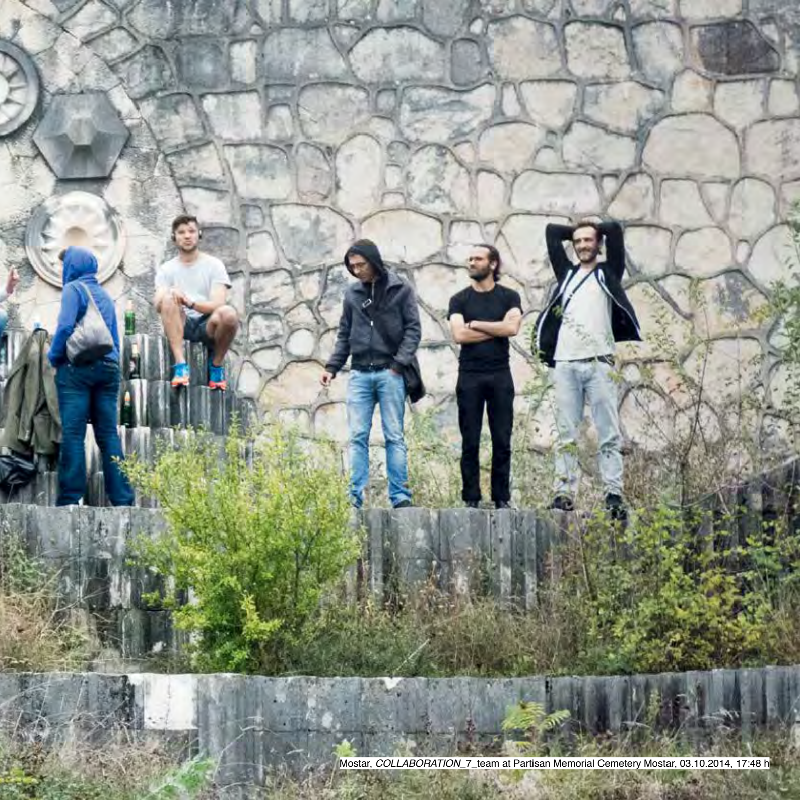
Mostar, COLLABORATION 7 team at Partisan Memorial Cemetery Mostar, 03.10.2014, 17:48 h