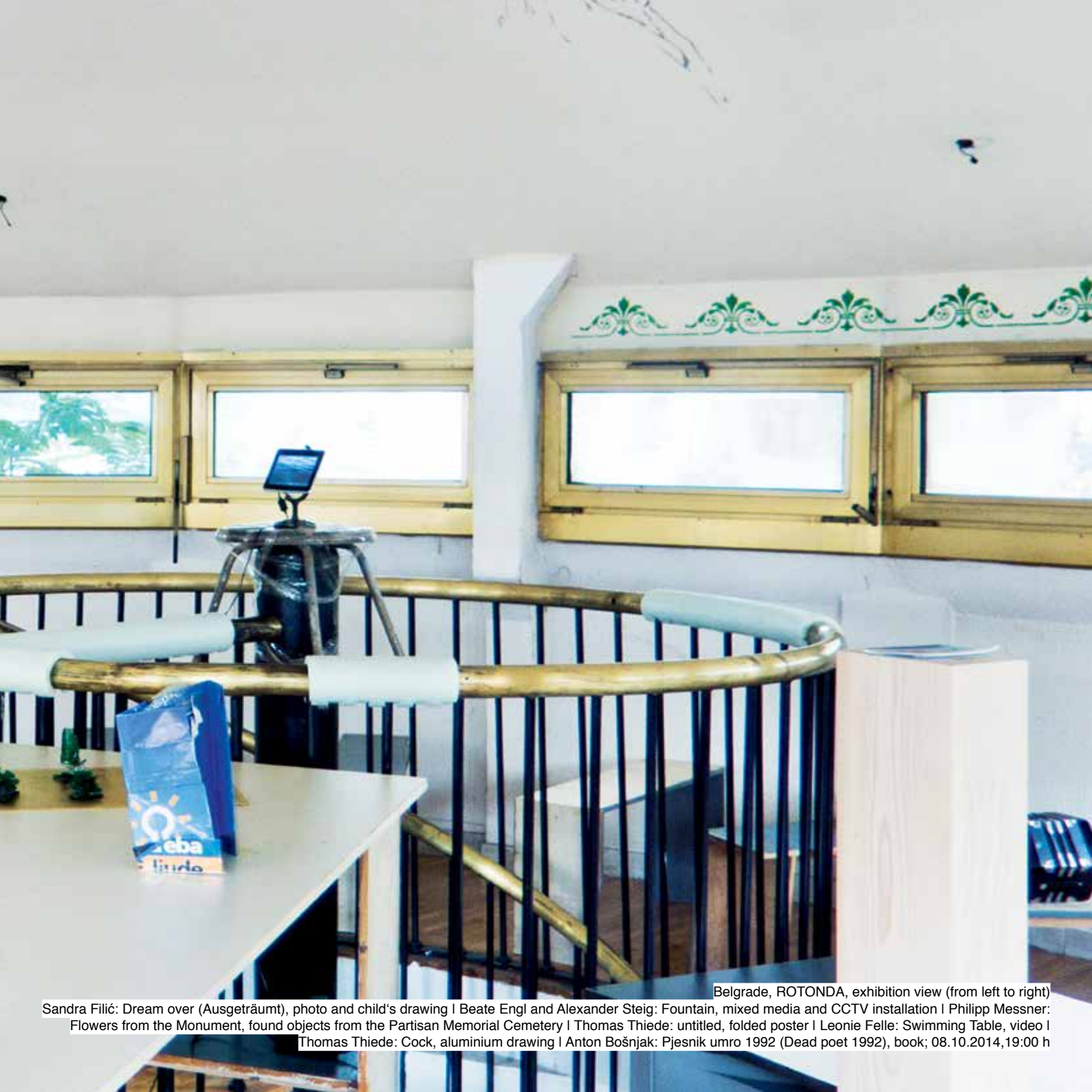
Belgrade, ROTONDA, exhibition view (from left to right)