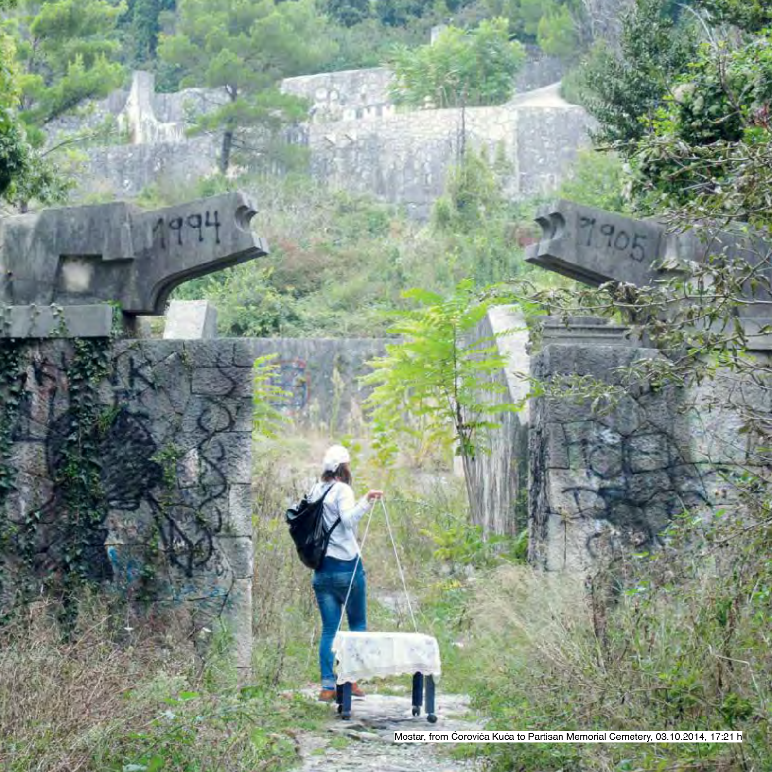
Mostar, from Ćorovića Kuća to Partisan Memorial Cemetery, 03.10.2014, 17:21 h