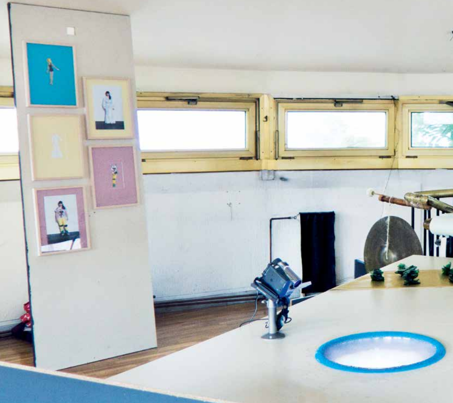
Table display: Beate Engl, Franka Kaßner with COLLABORATION_team