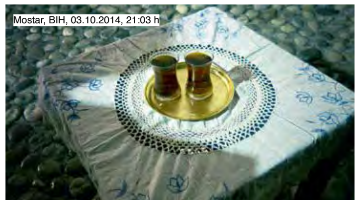
Mostar, BIH, 03.10.2014, 21:03 h