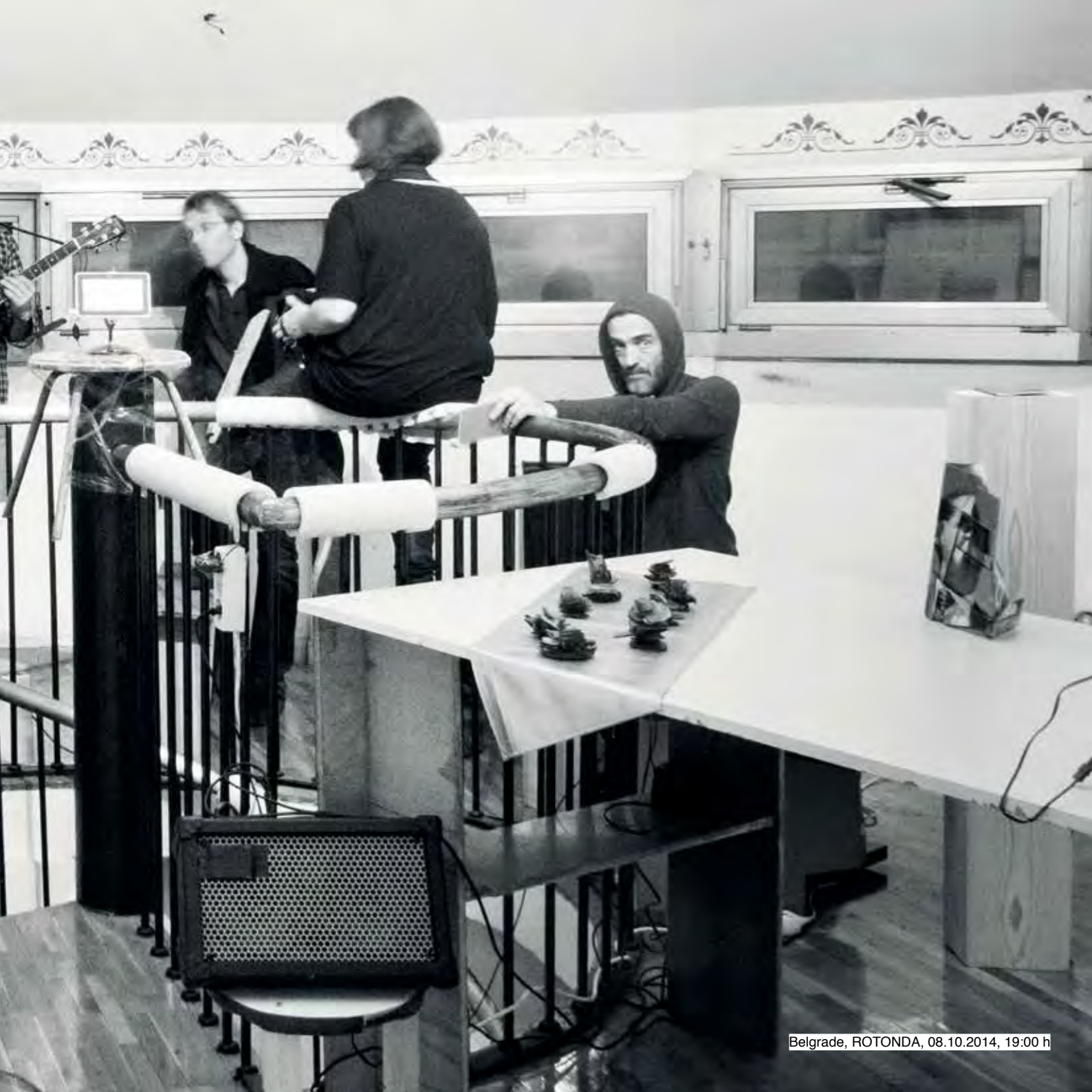
Belgrade, ROTONDA, 08.10.2014, 19:00 h