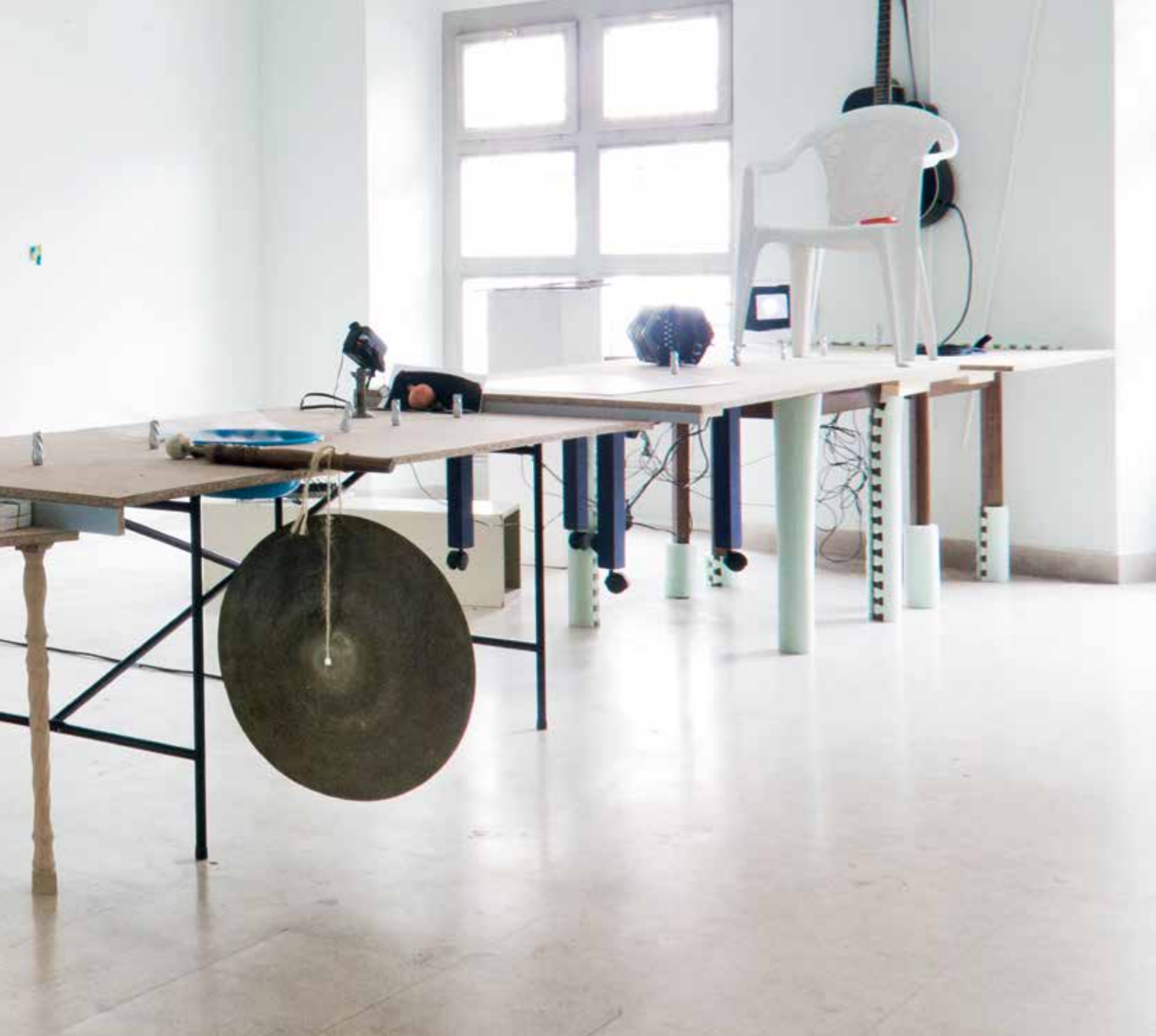
Mostar, Ćorovića Kuća, exhibition view (from left to right)