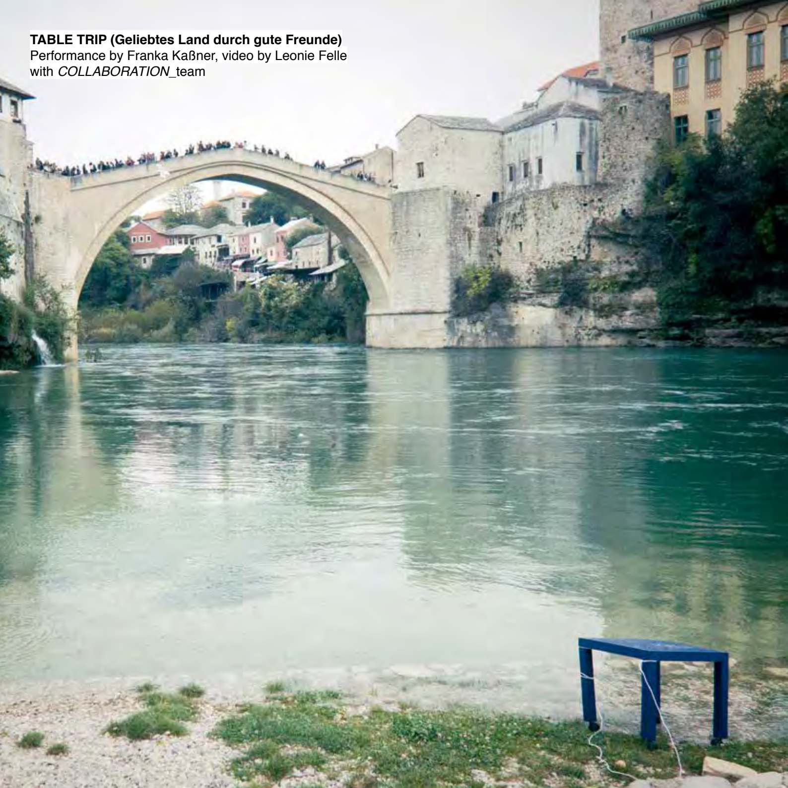
TABLE TRIP (Geliebtes Land durch gute Freunde) Performance by Franka Kaßner, video by Leonie Felle with COLLABORATION _team